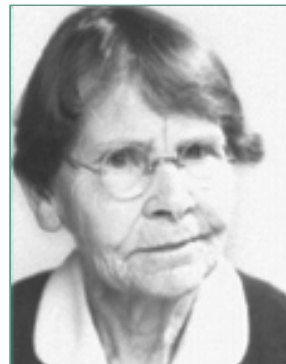
BARBARA MCCLINTOCK (June 16 1902 – September 2 1992), the 1983 Nobel Laureate in Physiology or Medicine, one of the world's most distinguished cytogeneticists.

To read the ballot measures, go to www.sos.ca.gov and click on ballot measures.