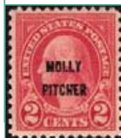
In 1928, "Molly Pitcher" was honored on a U.S. postage stamp. Festivities were being planned to celebrate the 150th anniversary of the Battle of Monmouth.