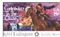
SYBIL LUDINGTON (n.d.) Known as the "female Paul Revere" in the Revolutionary War of 1776.